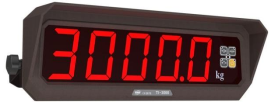
TD-2300F / TD-3000F(Optional)